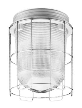
With optional P241 wire quard.