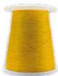
NPS - Multiway Spool Niehoff-Paket (NPS)