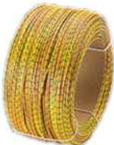
Standard Rings Standart Pappringe

Je nach Weiterverarbeitung bieten wir die Leitungen in verschiedenen Aufmachungsformen an: