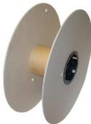
Winding Spool Wickelspule