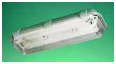
F9901/NS/WP - 1x24W Neptune

1x24W compact PL fluorescent Prismatic Non Maintained