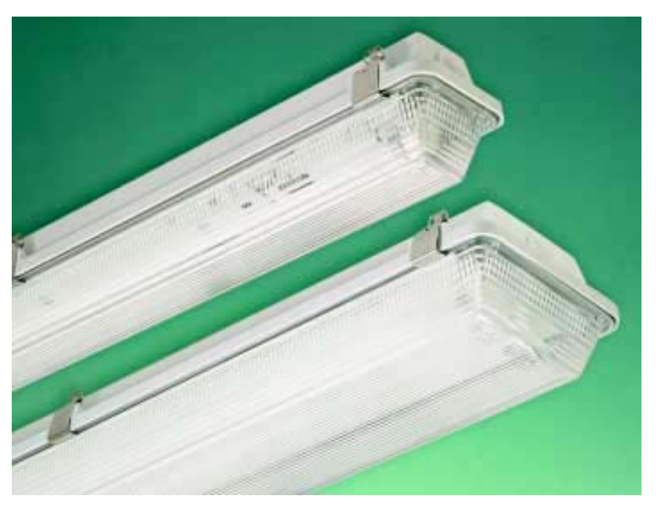
F9904/NS/WP - 1x36W Viking

Non Maintained Maintained Sustained Maintained