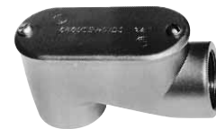
SLB (includes cover)