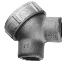
LBY (includes cover)