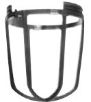
P50 – use with G54 globe