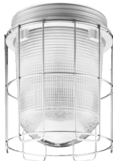
With optional P241 wire guard.