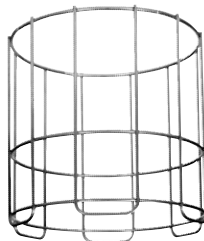
P33 – use with G303 globe