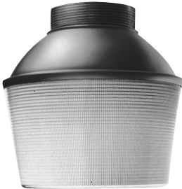
R2, R5, PR2, PR3, PR5