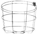
P23 – use with refractors