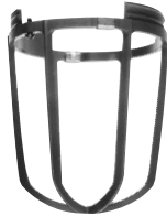
P21 – use with G24 globe