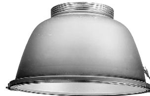
Reflector/Lens – Etched Alzak aluminum reflector/tempered glass lens