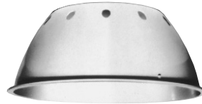
Dome – Krydon® material